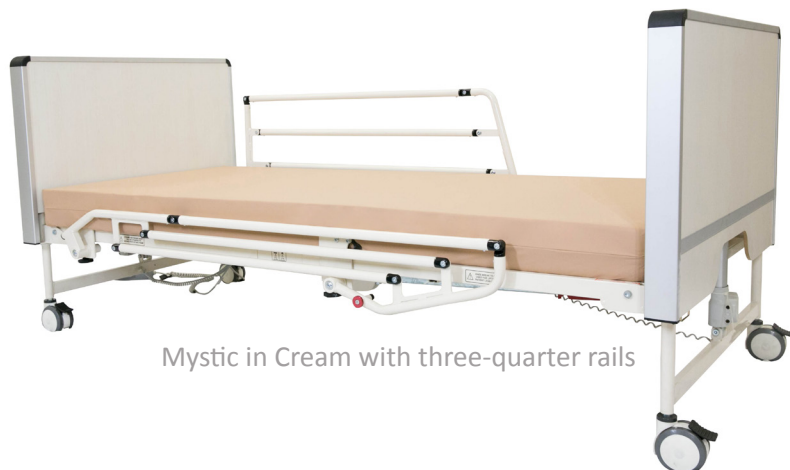
Mystic in Cream with three-quarter rails

Hi-lo bed with automatic self-fold function, perfect for community and facility care