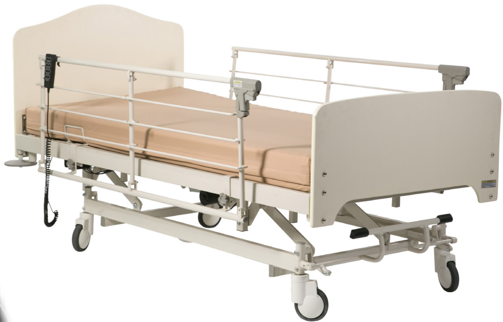
Universal Nursing Home Bed